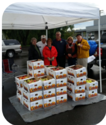
Apple & Pear Crew!

Thank you, Fred Meyer Community Rewards Staff