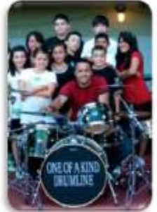
One of a Kind Drumline

FREE EVENT Clark County Veterans Court Board Helping SW Washington Veterans - ClarkCountyVetsCourtBoard.org P.O. Box 61628 - Vancouver, WA 98666