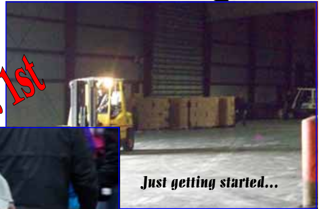
Just getting started...