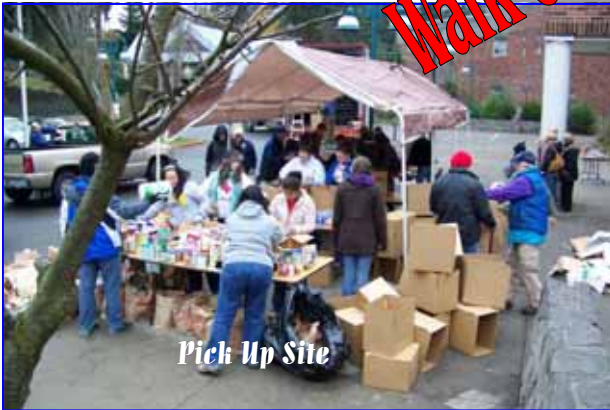
Pick Up Site