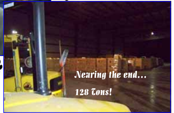
Nearing the end... 128 Tons!