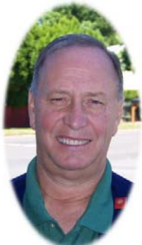
King Lion Al Rhyasen