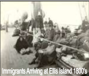
Immigrants Arriving at Ellis Island 1800's

Family folklore has my ancestors emigrating from Ireland in the 1850's with my great grandfather being killed on board ship, before it