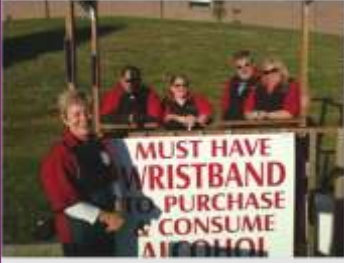
Wrist banding crew enjoying the great weather on our final concert of the season