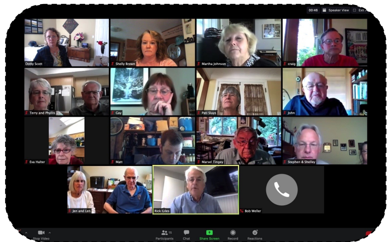
July Zoom Meetings