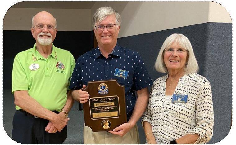
2020-2021 Melvin Jones Award Recipient