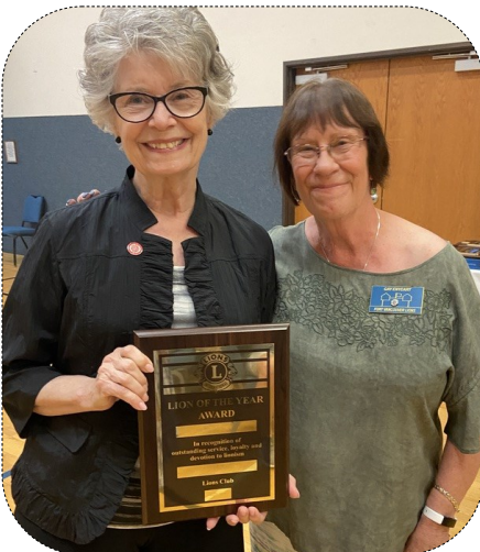
2020-2021 Lion of the Year