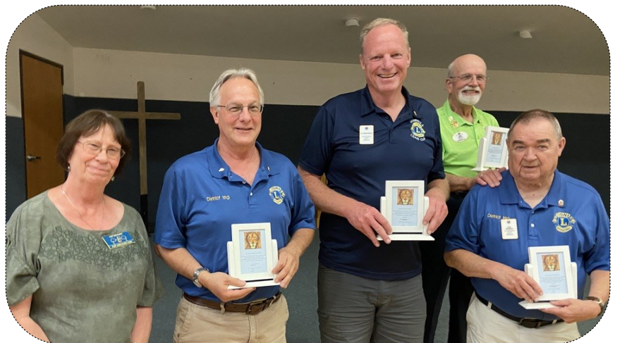
Thanking all of the DG dignitaries in attendance!