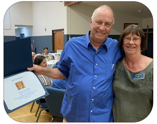
Welcoming new Lions