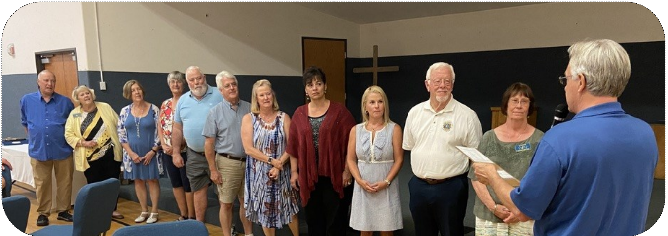
2021-2022 Board Members Installation