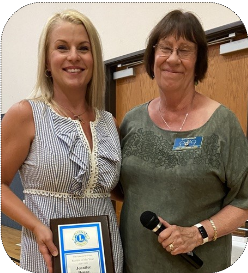
2020-2021 Rookie of the Year