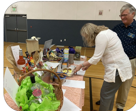
The Silent Auction table