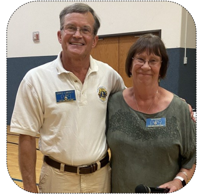
Thanking the 2020-2021 Board of the Fort Vancouver Lions