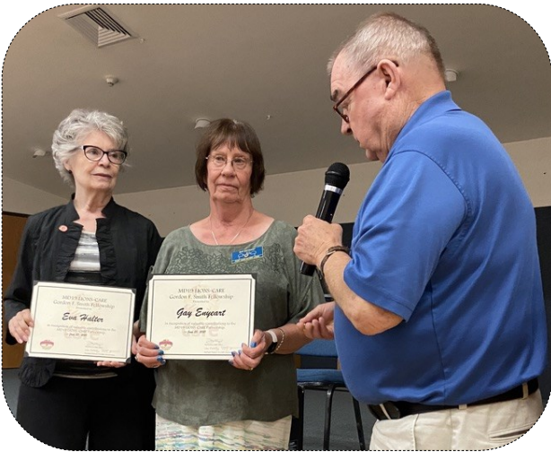
2020-2021 CARE Award Recipients