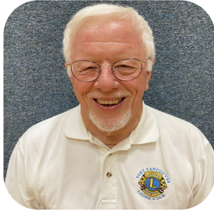
King Lion Bruce