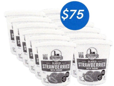
Sliced Strawberries with Sugar

Each 18-pound box is just $75 and has 12 containers (1.5 pounds each). Each container is sweetened with less than 4 ounces of sugar.